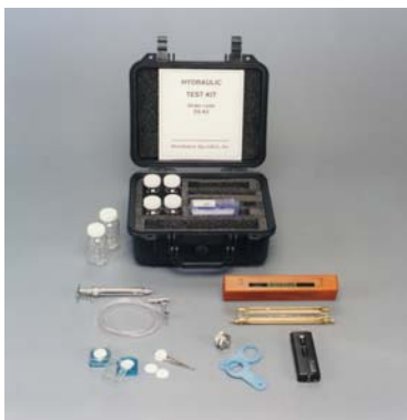
DSI Hydraulic Test Kit Order code DS K2